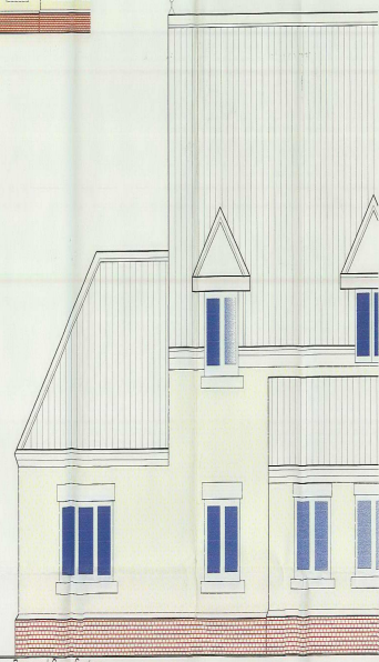
Proposed Cross Section SCALE 1:50