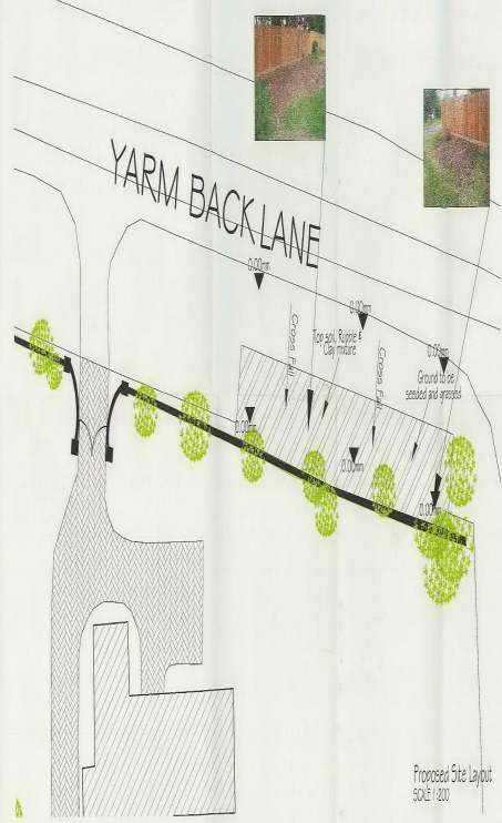
Proposed Site Layout SCALE 1:200