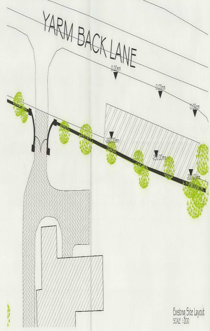
Existing Site Layout SCALE 1:200