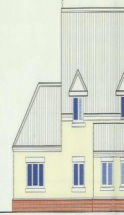
Existing Cross Section SCALE 1:100